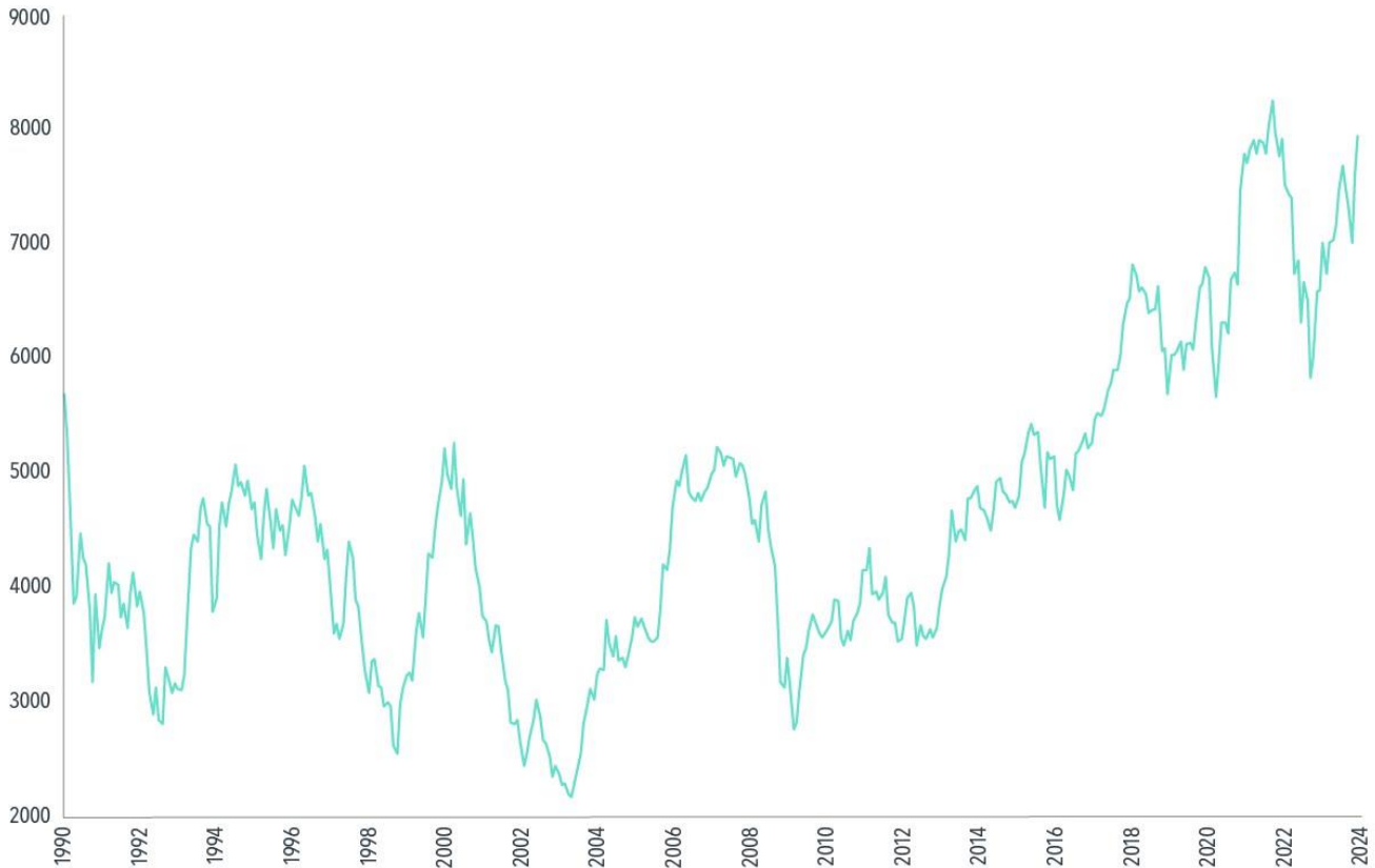
Exhibit 3 Land of the Rising Stocks : MSCI Japan Index (net div.) since 1990

After decades of lagging behind, Japan has lately been a bright spot in global markets. From 1990 to 2022, Japan saw its share of the global market cap decline from 40% to 6%. 14 But since September 2022, Japan has posted a return of 28.1%, with stocks there nearing an all-time high (see Exhibit 3).